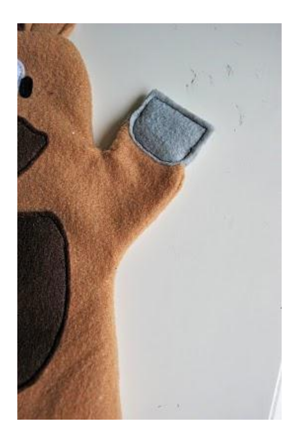
Now you have a set of completely ADORABLE puppets that your little ones will LOVE to play with.