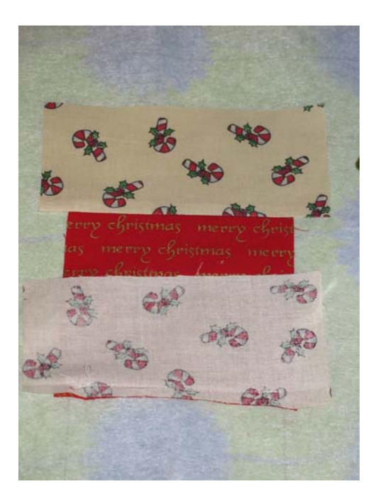
Piece 2 has been sewn and ironed open. Piece 3 has now been placed and pinned, ready for sewing.

(3) Continue to add patches in numerical order, following the numbered areas on the foundation. Remember with each piece to pin in place and make sure your patch will completely cover the required area before sewing it and then pressing it open.